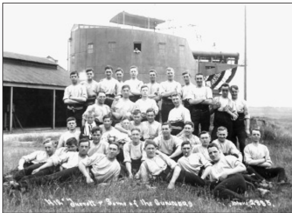
The new 12 inch gun turret provides a suitable, and dramatic, backdrop to the members of a c.1912 sea service gunnery course.