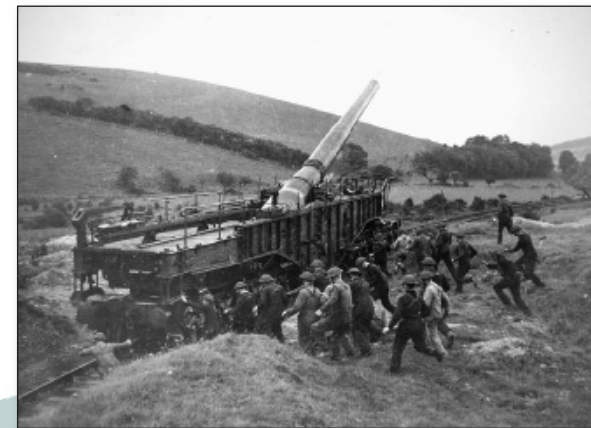
Men of the RM Siege Regiment manned some of the heaviest guns fired during World War II such as this 13.5 inch long range cross-channel rail-way gun. The gun having fired, the gun's crew close up to reload.