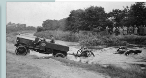
Above: Demonstration for senior officers of a 6 inch howitzer being hauled through Portsmouth Canal.