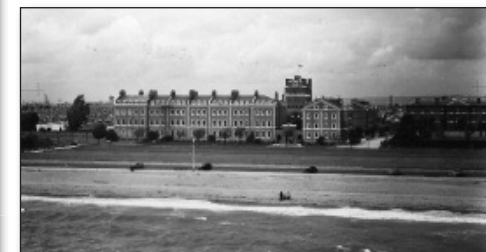
Below: Eastney Fort West and the officers' accommodation (Teapot Row) from seaward during the 1950s.