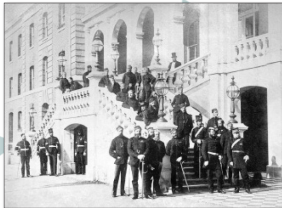
Casual group of RMA officers on the steps of the mess at Eastney, with NCOs to the left. Note the original tiled approach to the stairs and the original lamps.